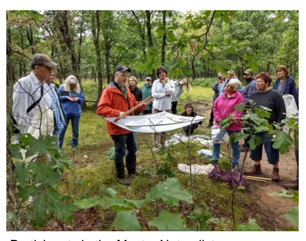
Participants in the Master Naturalist program explore an oak barrens near Fennville in the Allegan State Game Area.

2019 saw the revival of the MSU Extension Master Naturalist Program. The mission of the MIMN is to educate and involve diverse communities of individuals in environmental and conservation issues in Michigan. As a certified Michigan Master Naturalist, participants are encouraged to share their knowledge gained through enhancing their professional abilities, direct practice on their properties, and volunteer activities in their home communities. Participants experienced hands-on learning at two locations in Allegan County – Trevor Nichols Research Center and Allegan Pine Plains Natural Area. There were 31 graduates from the program.