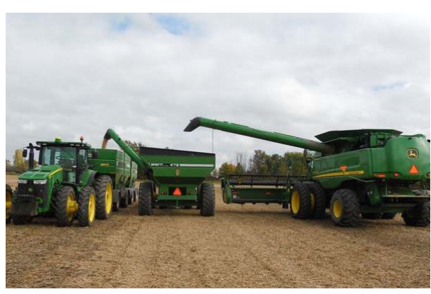
SMaRT trial harvest in progress.

Allegan County Soybean Educator, Mike Staton, hosted an educational session on the 2018 SMaRT on-farm research results and recommendations for managing soybean cyst nematodes that was attended by 17 Allegan County growers. Turning point and open-ended questions were used to gather input form the participants regarding research topics for 2019 and recruited new trial cooperators. Production topics evaluated in 2019 were planting rates, seed treatments, row spacing, fertilizer, fungicide, spring tillage, cover crops and planting date.