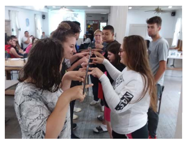
Camp Leaders and counsellors learn ice breaker activities to use with their campers.