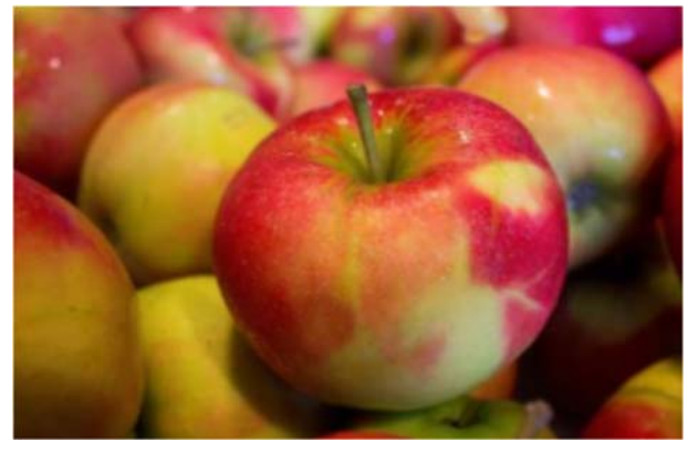
With more than 900 million pounds of apples produced per year, apples are Michigan's largest fruit crop.