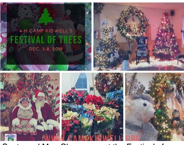
Santa and Mrs. Claus pose at the Festival of Trees.

Each winter, MSU Extension and the 4-H Camp Kidwell board turn camp into a "Winter Wonderland" featuring beautifully decorated trees and wreaths. The money raised at the Festival of Trees goes to finance the operational side of 4-H Camp Kidwell. People come from all over the county for a chance to visit with Santa, make cookies with Mrs. Claus and have a meal with family and friends! This year, the Festival of Trees raised over $45,000 for camp and scholarships for kids. A huge thank you to all those who volunteered and attended!