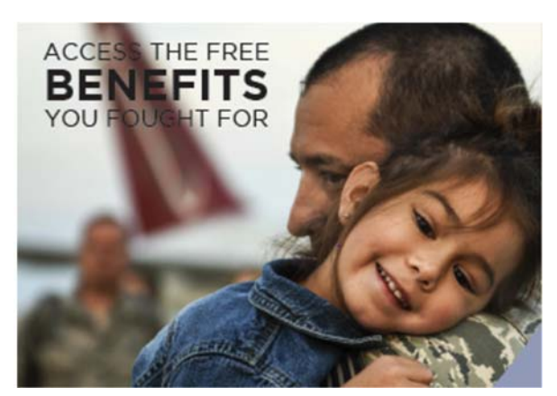
MSU Extension helps veterans access the benefits they have fought for.