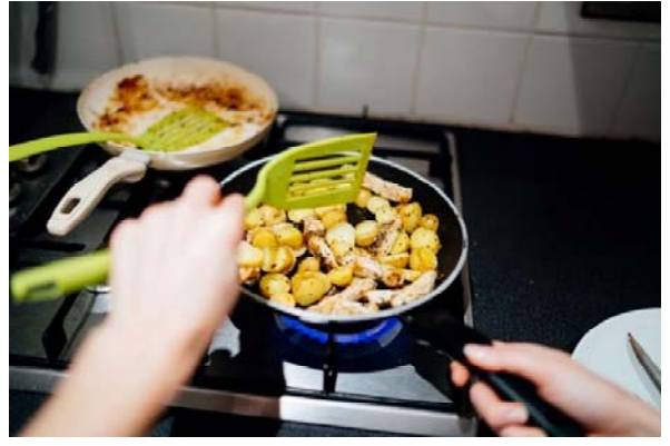
MSU Extension aims to improve the knowledge, skills and behavior of how individuals view nutrition.

Dining with Diabetes covers topics such as healthy eating, being active, monitoring, taking medications and reducing risks.