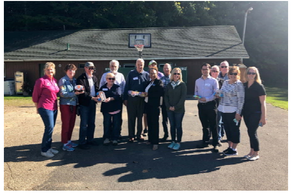
The District 7 MSU Extension Advisory Council visits Camp Kidwell and honed their robotics skills.