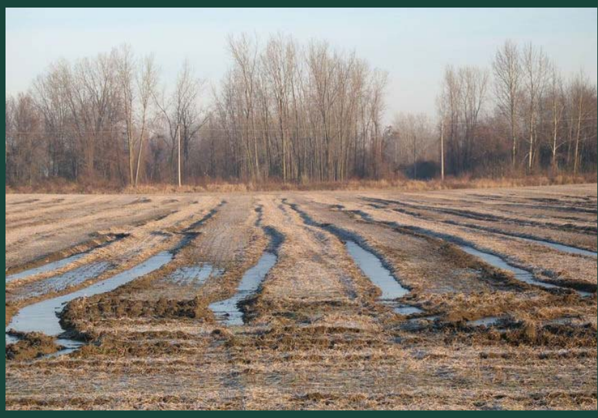
Photo: Deep ruts created by harvesting soybeans in wet soil conditions.

<u>The issue</u>: Throughout Michigan and the Midwest, prolonged wet weather and flooding in spring 2019 put farmers in a difficult financial position. Many farmers delayed planting and greatly adjusted management practices. Some fields were not planted at all. Due to these conditions, farmers faced a unique set of challenges in fall of 2019 making harvest related decisions.