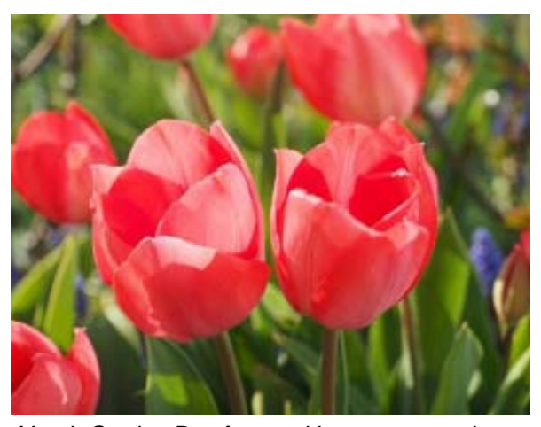
March Garden Day featured lectures on topics such as pollinators, pests, and community gardens.