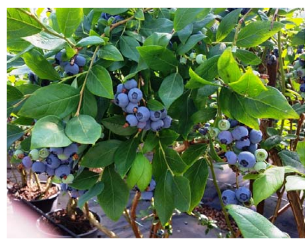
Michigan blueberry growers produce about 100 million pounds of blueberries every year, making MI a leader in blueberry production.